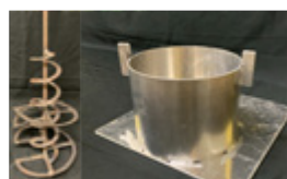
Broom & Squeegee Bundle 850 Auger & Bucket Holder